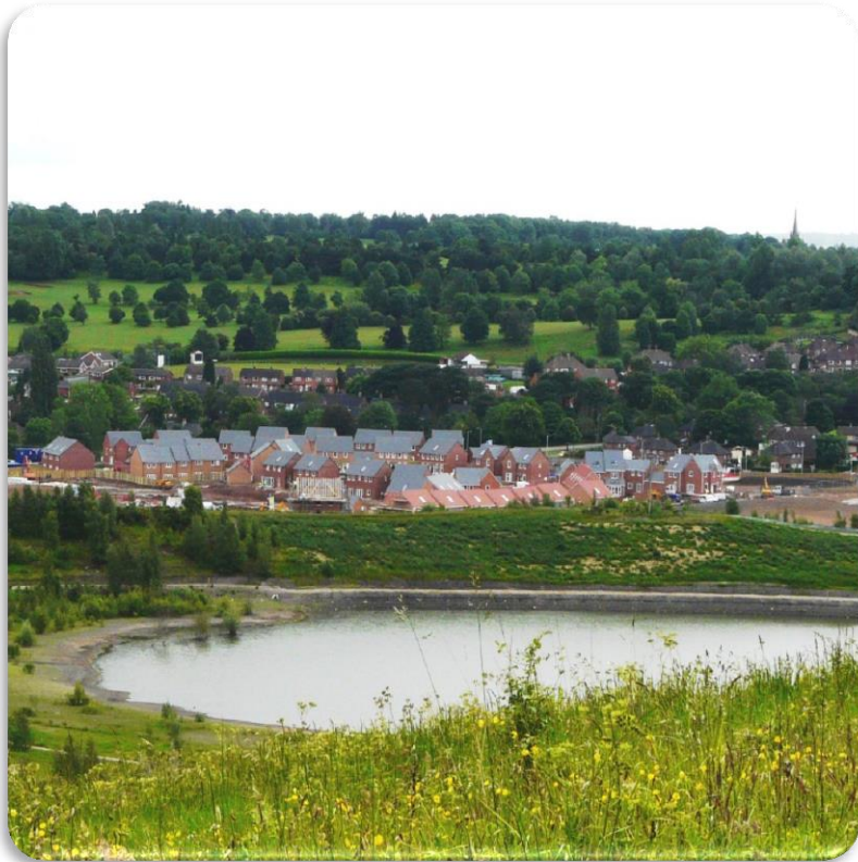
Housing at Silverdale