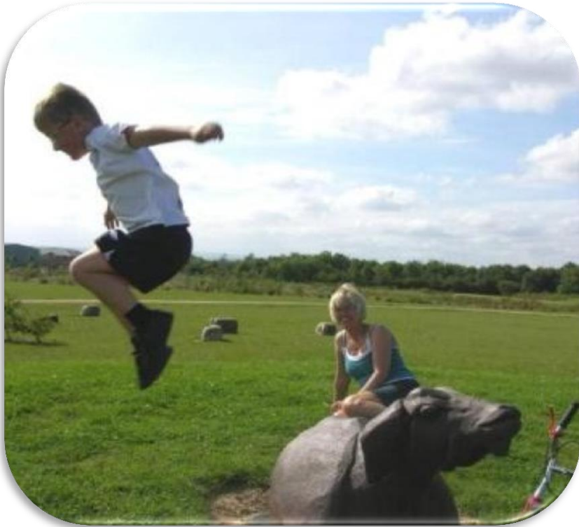
Phoenix Park, Yorkshire